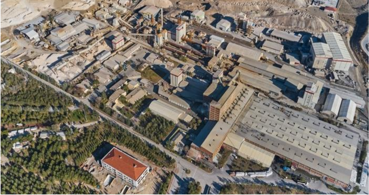
KÜMAŞ Magnesite Inc. Production site

Today, KÜMAŞ provides sintered magnesite, fused magnesite, fused oxochrome, and calcined magnesite derivatives as industrial raw materials. Additionally, it manufactures magnesite, dolomite, and alumina-based refractory bricks and mortars at its integrated brick and mortar plants. Located on the Kütahya Province, Eskişehir Road 9th Km, KÜMAŞ operates over a total area of 695,270 m 2 , with 68,561 m 2 dedicated to closed facilities. Their product range includes "Sintered Magnesite, Calcined Magnesite, Fused Magnesite, Kures Powder, and Refractory Bricks and Mortar."